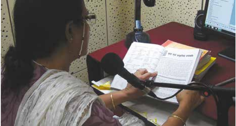
A woman recording a book into audio.