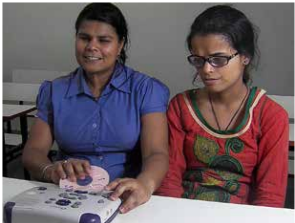
Two women using a DAISY reading device.

Can your company or government make a contribution? Donations of any size are most welcome and can be earmarked to fund specific projects. In-kind contributions are also welcome.